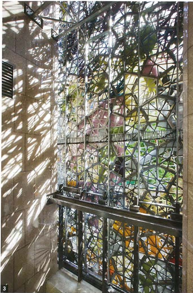
3. As light streams through the unusual patterns of the façade, shadows dance across the walls of the shopping centre.