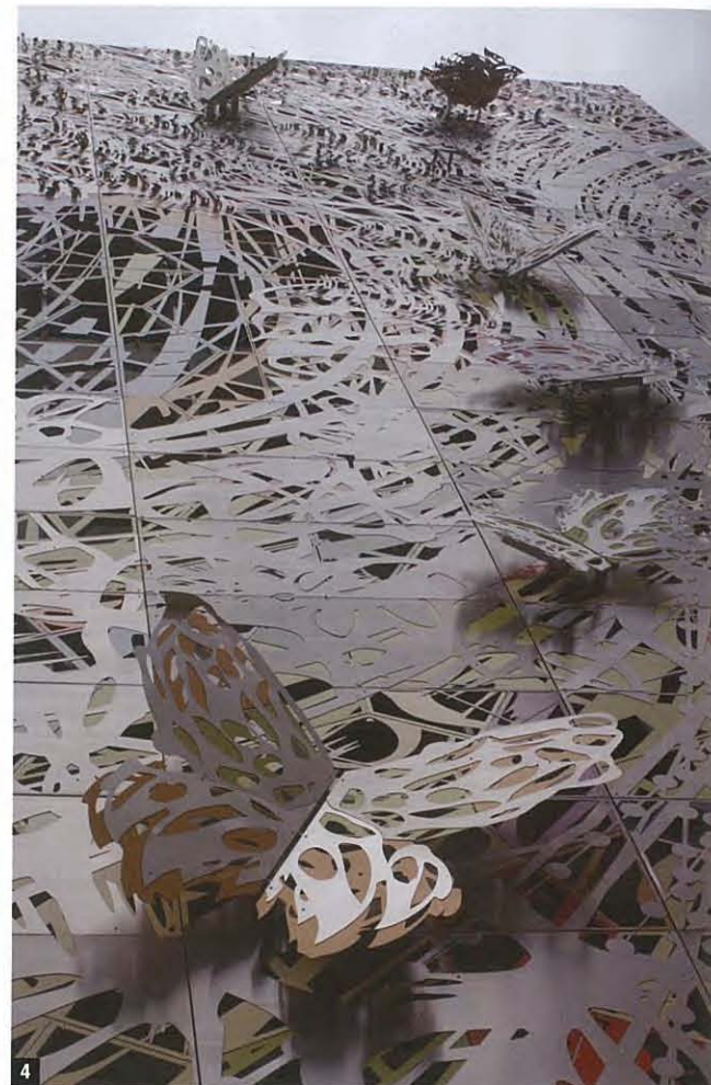
4. The texture of the façade creates depth and the illusion of movement.