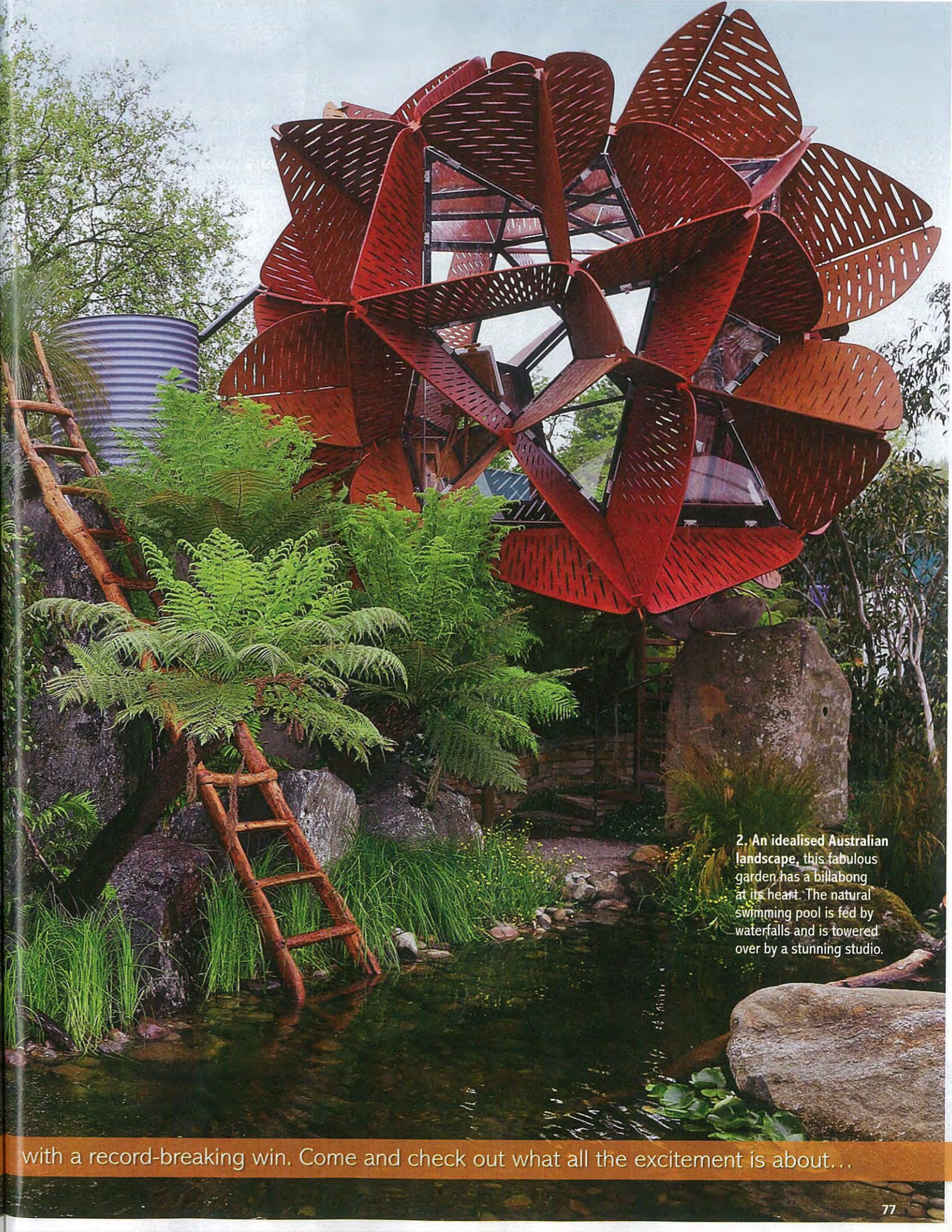
2. An idealised Australian landscape, this fabulous garden has a billabong at its heart. The natural swimming pool is fed by waterfalls and is towered over by a stunning studio.

You little beauty! It's been a great Aussie triumph at the Chelsea Flower Show this year